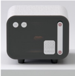
Step 2 - Start

Place perished food item inside of Foodbot. In this example it is a 1 year old Apple