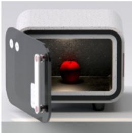
Step 3 - Eat!

Using a combination of UV disinfectant rays, electrical cords, metal, buttons, glass, and a turning tray, the food starts to disinfect inside Foodbot.