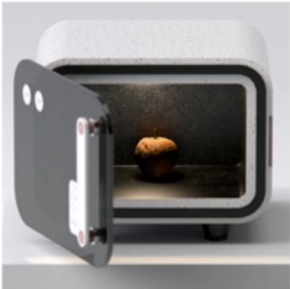
Step 1 - Load

Place perished food item inside of Foodbot. In this example it is a 1 year old Apple